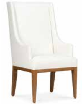
Layton Host Arm Chair 24.5"W x 27"D x 46"H 01-649