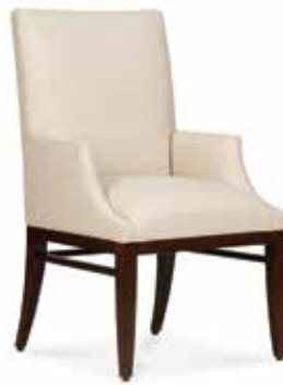
Bergen Arm Chair 24.5"W x 26.5"D x 40"H 01-535