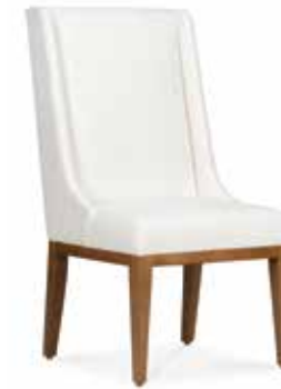
Layton Host Side Chair 22"W x 27"D x 44"H 01-648