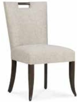
Darby Side Chair 21"W x 25.5"D x 38.5"H 01-670