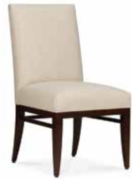
Bergen Side Chair 21"W x 26.5"D x 40"H 01-534