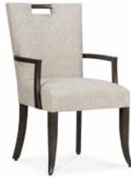
Darby Arm Chair 23"W x 25.5"D x 38.5"H 01-671