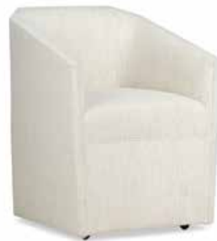
Edina Castered Chair 24.5"W x 25.5"D x 32"H 01-791