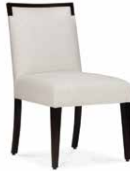
Everette Side Chair 20.5"W x 26"D x 36"H 01-780