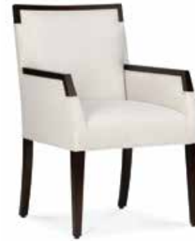
Everette Arm Chair 23"W x 26"D x 36"H 01-781